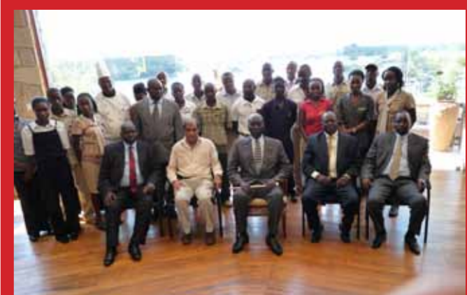
Former President of Kenya Daniel Troitichi Arap Moi visited Chobe Safari Lodge on a private visit which he thoroughly enjoyed and he was taken back by Uganda's beauty and warm hospitality shown by the entire Team at Chobe Safari Lodge. He promised to come back soon again.

We would like to introduce to you Reginald the buffalo, the long-term resident at Chobe. Visitors at Chobe are always amazed to see him wandering around the grounds and in this case taking in the sun besides the pool together with one of our guests!