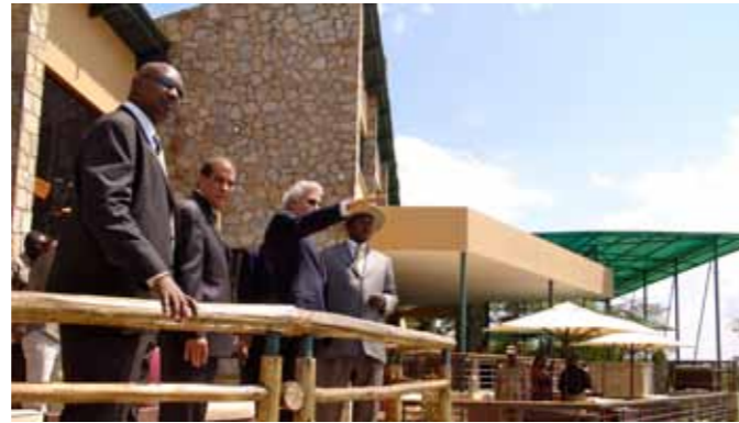
H.E. The President opens Chobe Safari Lodge page 13