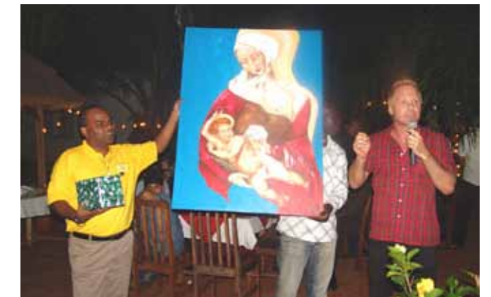
Auctioning of one of the paintings to raise funds for the hospital