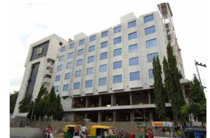
Update from Madhvani Group's India Hotels. Page 21