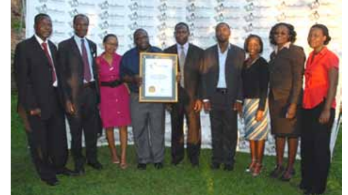
Madhvani Foundation recognised as a Superbrand in East Africa Page 20