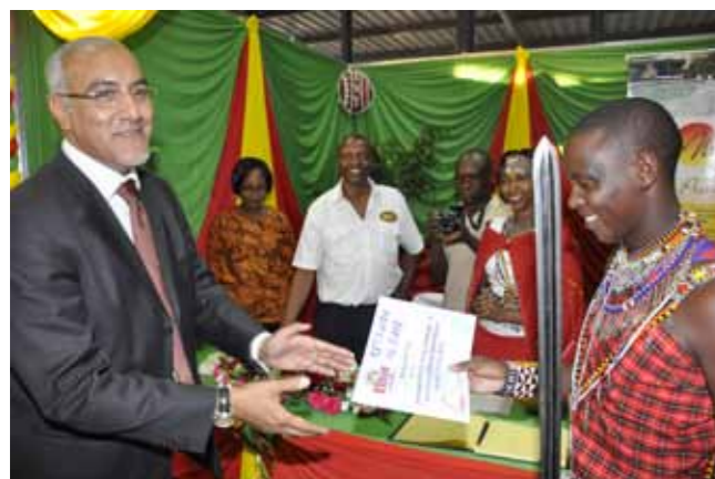
Mara Leisure Camp exhibits at Magical Kenya Get Away Show