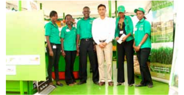
Madhvani Group wins Award in Rwanda. Page 28