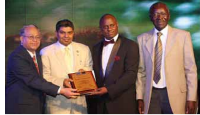
EADL recognised in top 100 Mid-sized Ugandan Companies. Page 26

Big Presentations Ltd Jumbo Plaza, P.O.Box 6386 - Kampala Tel: +256 39 2964308 E-mail: mulindwa@gmail.com