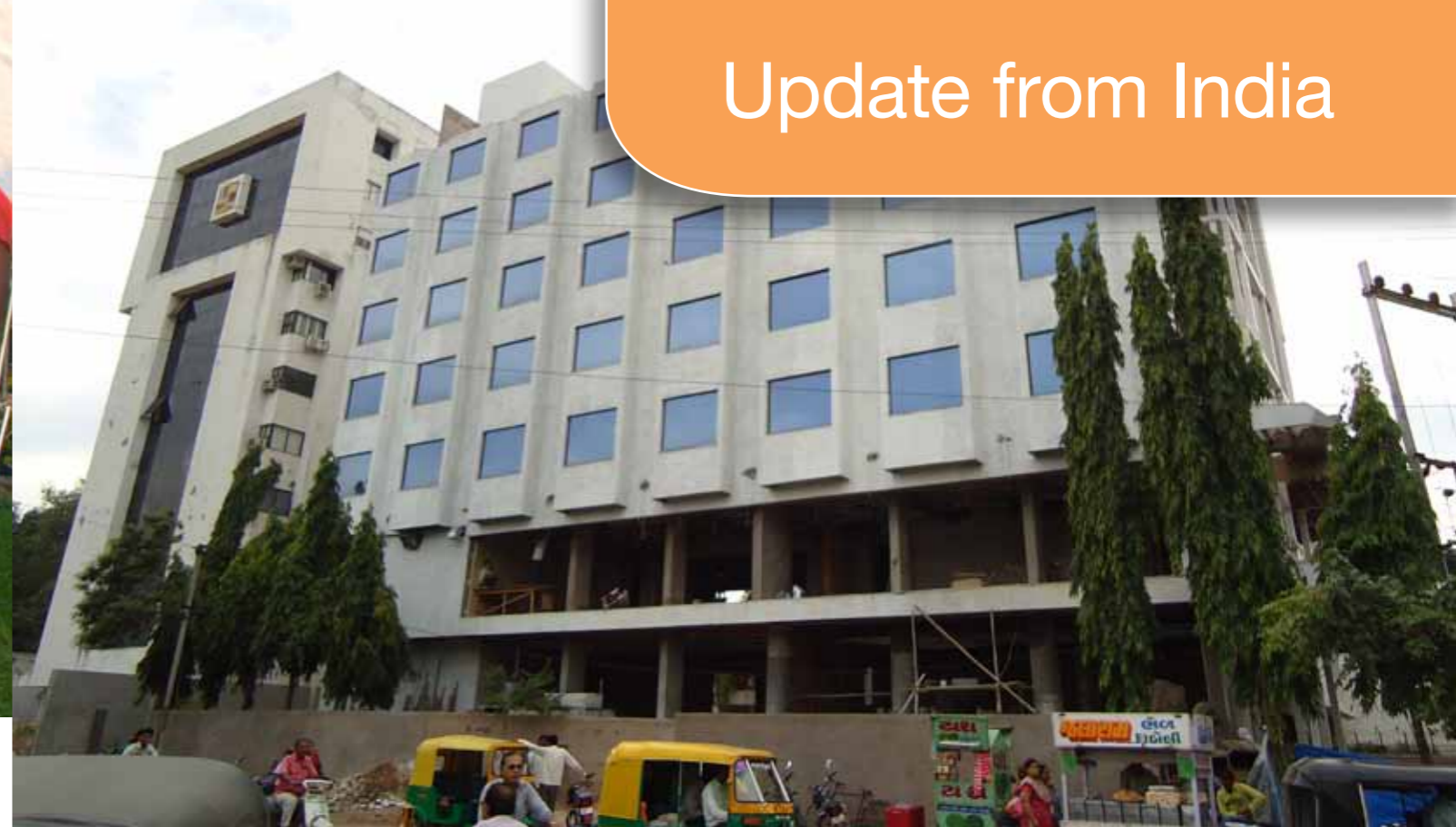
The new look of the Sarovar Portico – Rajkot