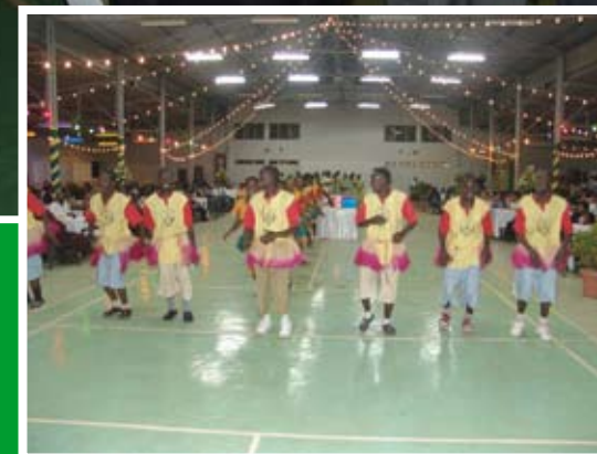
Nile Beat cultural group entertains the guests