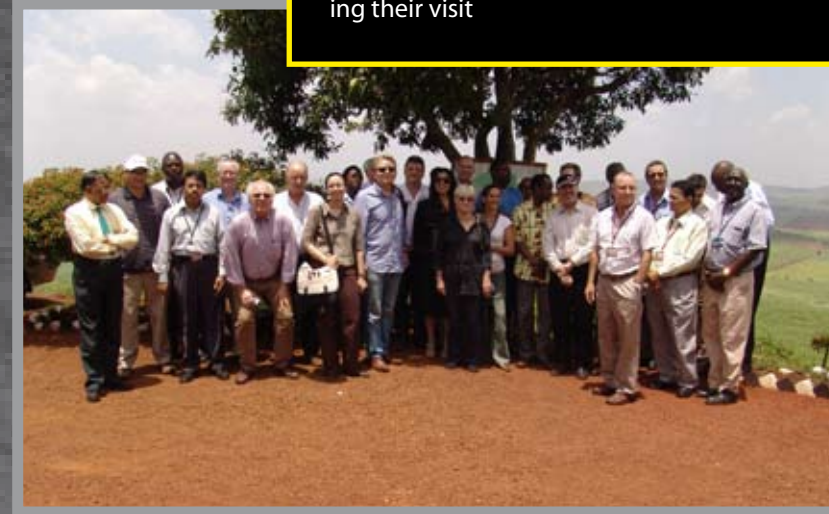
Members of the Eastern Africa Association together with Kakira Officials during their visit