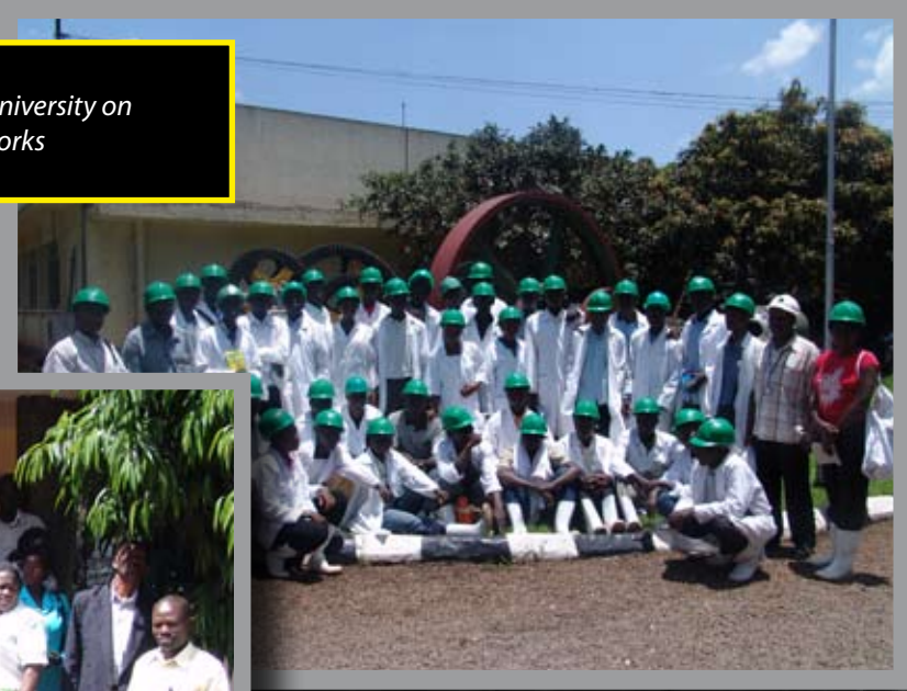
Students from Gulu Agricultural University on their study tour of Kakira Sugar Works