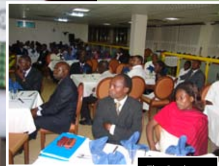
The Graduates listening to the speaker

Radio One's Maria Kiwanuka, the Chief Guest, delivered a talk on starting and managing a successful business in modern day Uganda. She also spoke of the challenges and how to overcome them. "Understand your market. Be an entrepreneur not a gambler. Take courage. Be honest with yourselves. Be patient and do not forget the market. Research is an important aspect," Maria advised.