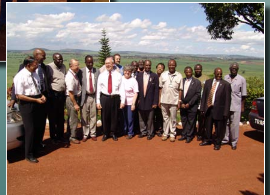
The guests and the Kakira officials pose for a group photo