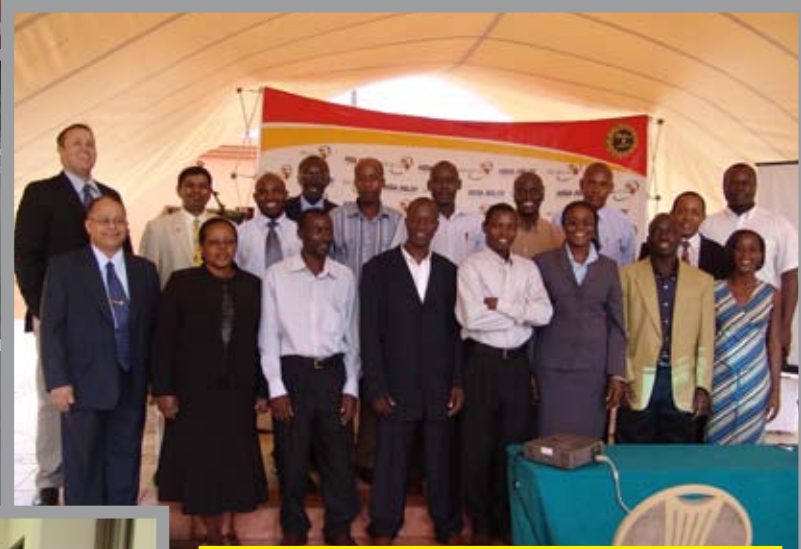
East African Distributors officials take a group photo after their cocktail at Serena Hotel