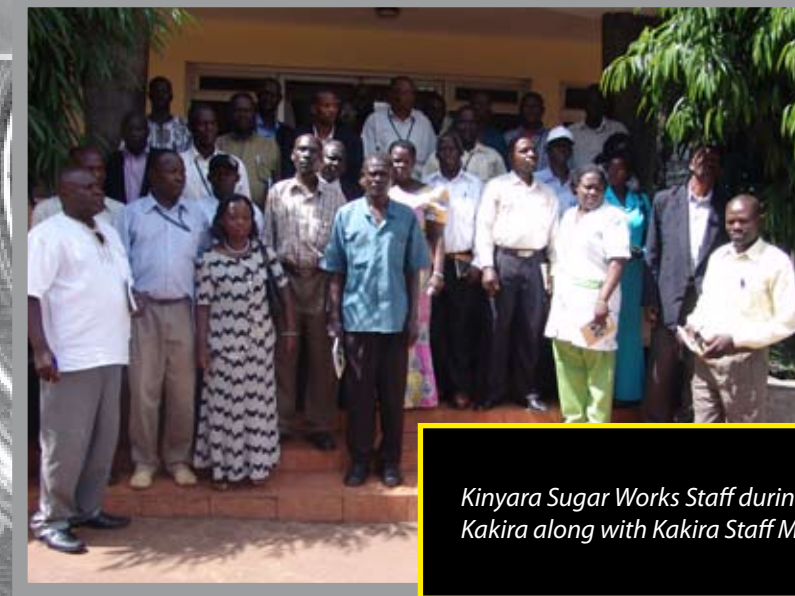
Kinyara Sugar Works Staff during their visit to Kakira along with Kakira Staff Members