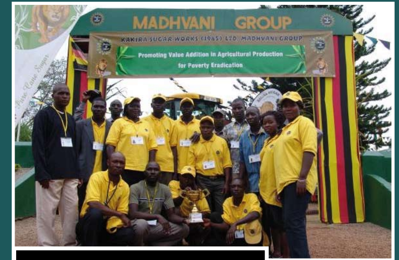
The Madhvani Group Show Co-ordinators pose for a group photo

We were privileged to have had the Minister of Agriculture, Animal Industry and Fisheries, Hon. Hope Mwesigye and the two State Ministers for Agriculture, Hon. Aggrey Henry Bagaire and Hon. Bright Rwamirama, who commended the good work that the Madhvani Group of Companies is doing for the economy of Uganda. The show-goers, especially the schools, liked our display and explanations to the students, which they noted were very educative and commended the Group for their contribution to the education development in this country. UNAFFE organised an exhibitors' dinner where we got to share with the organisers our concerns about the